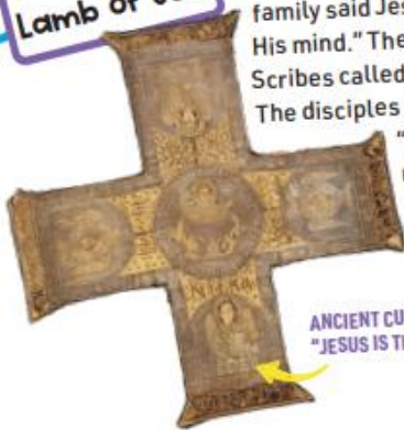
ANCIENT CUP COVER THAT SAYS, "JESUS IS THE MESSIAH"

A few times in Mark's Gospel, Jesus was called the wrong name! His family said Jesus was "out of His mind." The Pharisees and Scribes called Him a "blasphemer." The disciples rightly called Jesus "teacher," but He was more than that. Peter was the first disciple to confess Jesus was the one the prophets spoke of—the true Messiah!